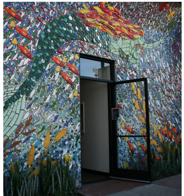
Entrance to Rainbow’s Resource Center