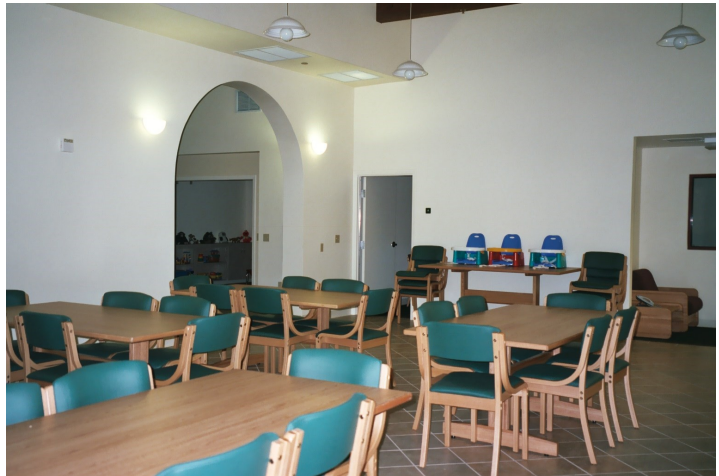
Rainbow House dining hall, 2005

I was a residential worker then – there was definitely a lot of power over. A lot of control over client schedules, what they eat, what was best for them and their kids. It was so hard for staff! We were the ones who had to deal directly with participants, and in a super-uncomfortable, demeaning and demanding way. But we had no other choice – this was our job. The management at the time put a lot of pressure on staff. Participants were scared, angry, and avoided interacting with many staff when they could. Staff came and went. Participants were coming and going without the supports they needed. No one really felt good about the work we were doing or felt very hopeful for participants lives changing. We weren't seeing the successes we worked so hard for.